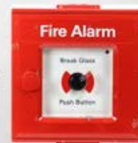
Fire Alarm Buttons